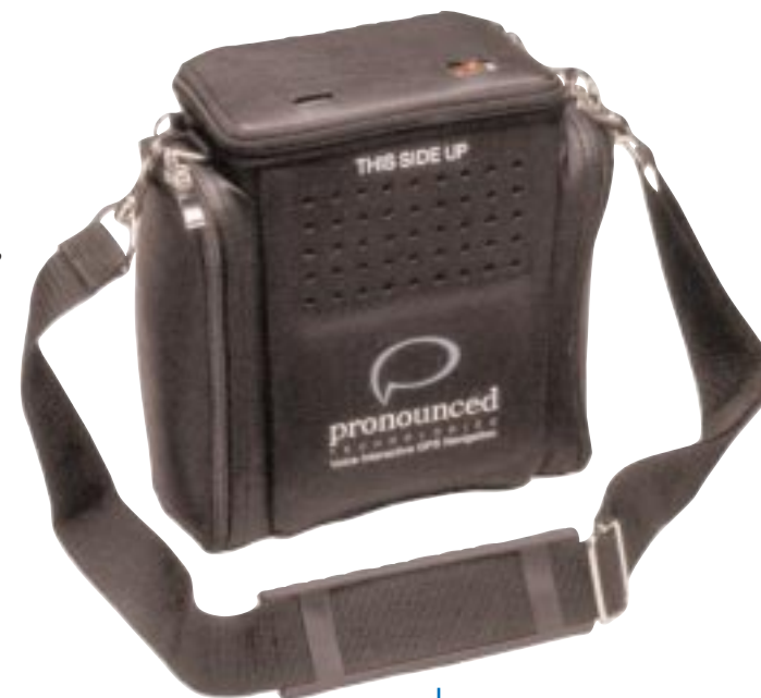
Carrying case and strap for taking it from car to car. Compact size – 8" x 6" x 4"