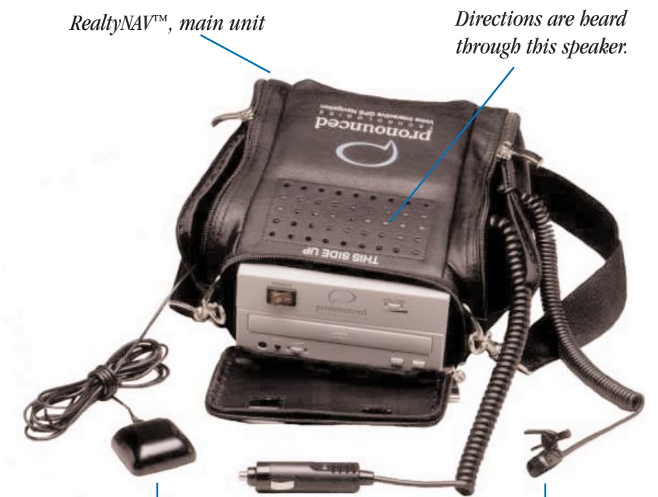
Global positioning sensor. Magnetic, roof mount. Can also be placed on the dash.